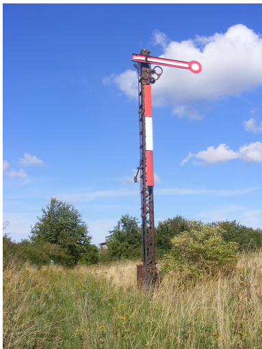
(Ger.) Signalmast, Formsignal