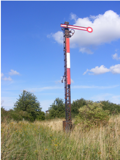
(Ger.) Signalmast, Formsignal